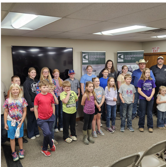
Recent Feed Mill Tour